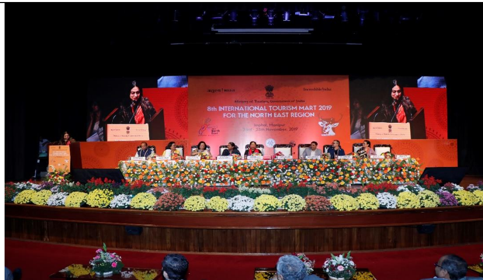
Addl. DG (T) addressing the gathering during the of EBSB at the International Tourism Mart 2019 held at Imphal from 23 rd to 25 th of November, 2019