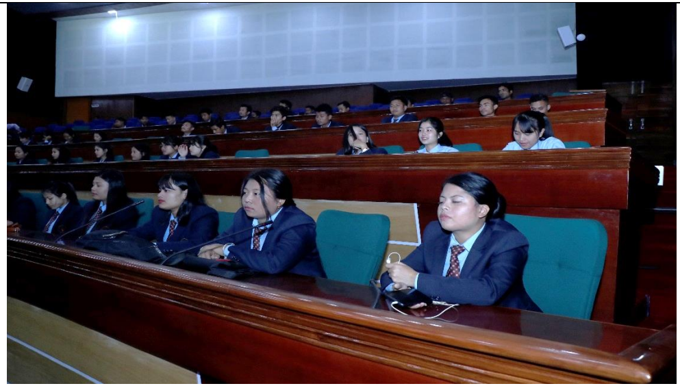
Students / Youths from University and Tourism Institutes attending the presentation by Director (Investment & Tourism) Govt. of Madhya Pradesh during ITM 2019 as it is a paired State with Manipur on 24 th November, 2019