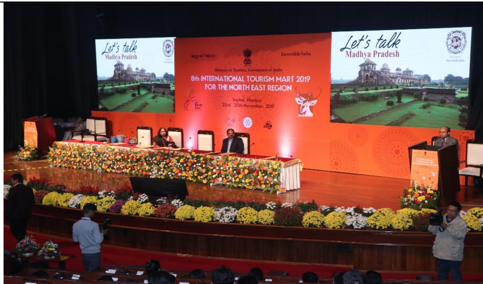
Director (Investment & Tourism) Govt. of Madhya Pradesh addressing the students/youths during ITM 2019 as it is a paired State with Manipur on 24 th November, 2019