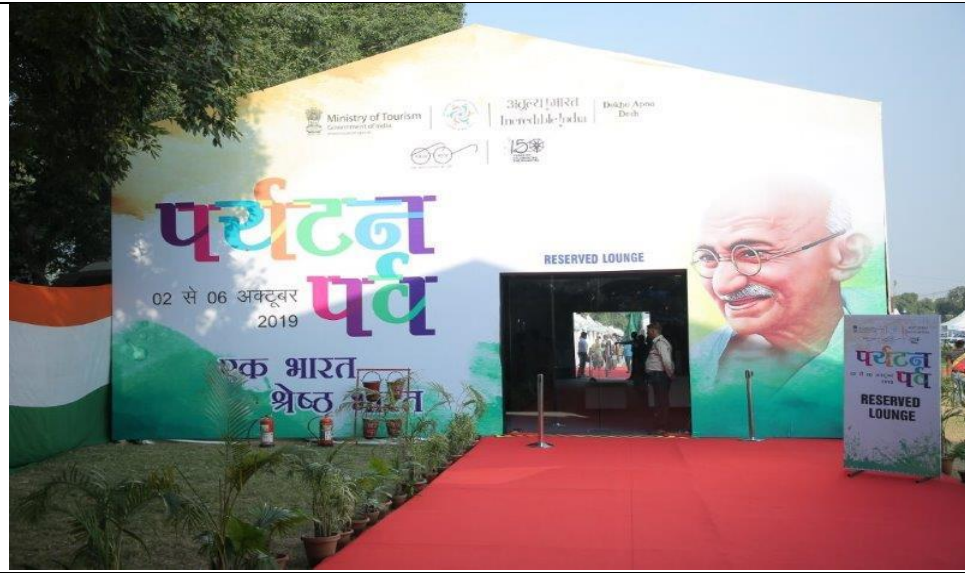
Reserved Lounge Paryatan Parv Rajpath Lawns, New Delhi October 2-6, 2019