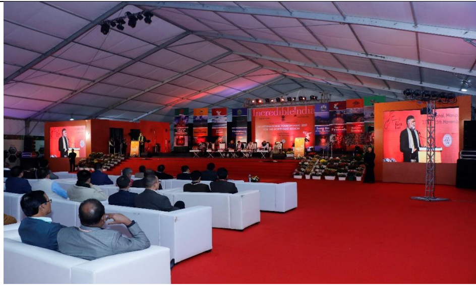
Hon'ble Union Minister Tourism addressing the gathering during the inaugural ceremony of International Tourism Mart 2019 at Imphal on 23-11-2019