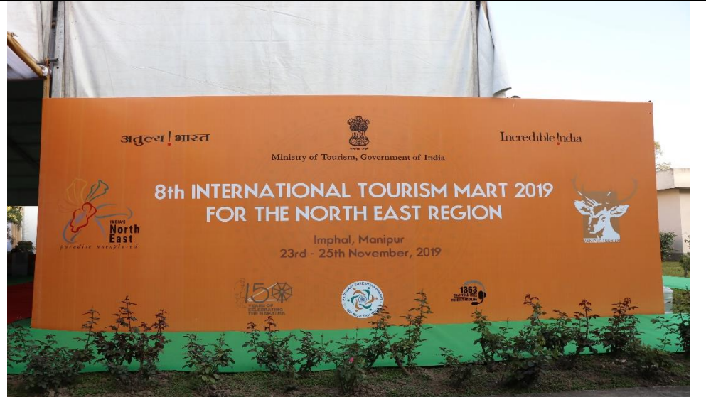
Branding at the dinner venue with EBSB logo of International Tourism Mart 2019 held on 23 rd November, 2019