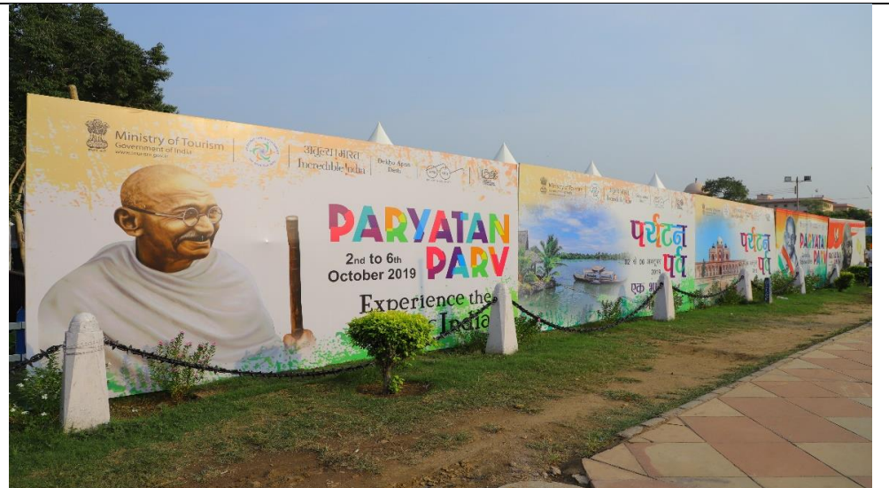
Branding of EBSB at Paryatan Parv Rajpath Lawns, New Delhi October 2-6, 2019