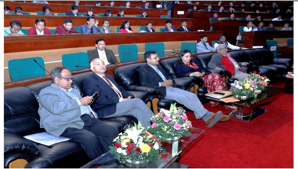
Students / Youths from University and Tourism Institutes attending the presentation by Director (Investment & Tourism) Govt. of Madhya Pradesh during ITM 2019 as it is a paired State with Manipur on 24 th November, 2019