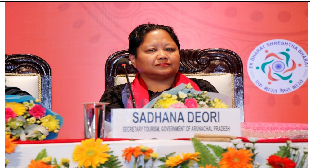
Branding of EBSB at the International Tourism Mart 2019 held at Imphal from 23 rd to 25 th of November, 2019