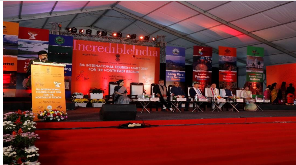
Secretary Tourism Govt. of India addressing the gathering during the inaugural ceremony of International Tourism Mart 2019 at Imphal on 23-11-2019