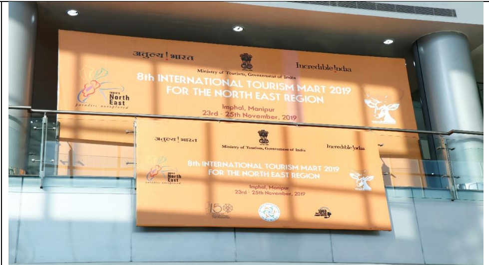
Branding of EBSB at the International Tourism Mart 2019 held at Imphal from 23 rd to 25 th of November, 2019