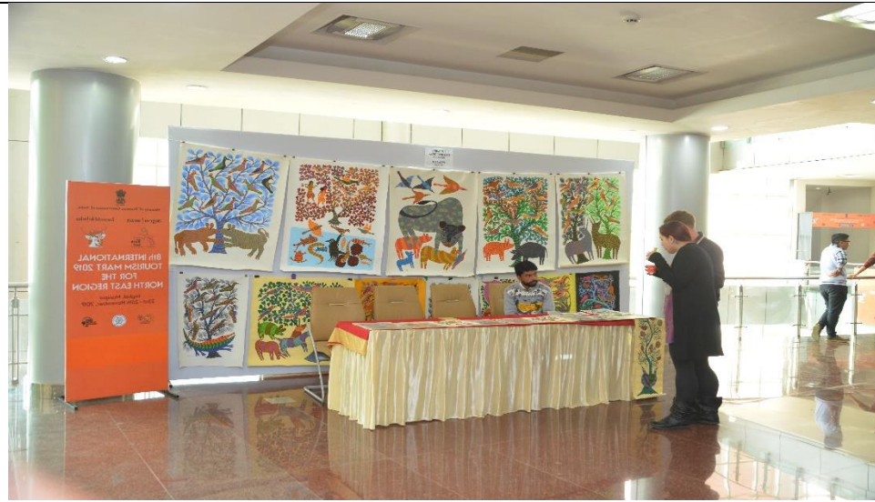
Gond Artist from Madhya Pradesh displaying paintings during ITM 2019 as it is a paired State with Manipur (as per EBSB paired state matrix) on 24 th November, 2019