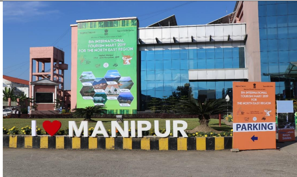
Branding of EBSB at the International Tourism Mart 2019 held at Imphal from 23 rd to 25 th of November, 2019