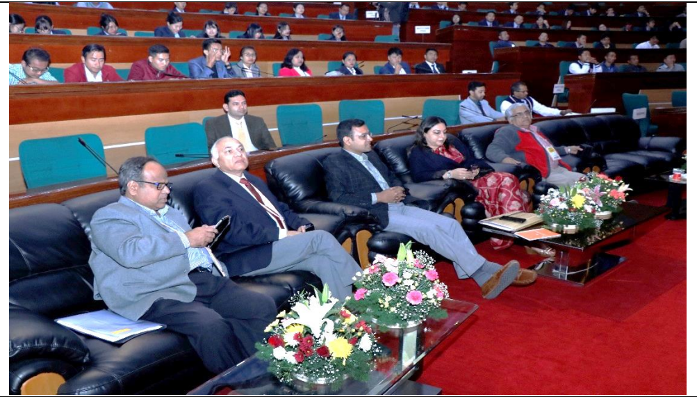
Students / Youths from University and Tourism Institutes attending the presentation by Director (Investment & Tourism) Govt. of Madhya Pradesh during ITM 2019 as it is a paired State with Manipur on 24 th November, 2019