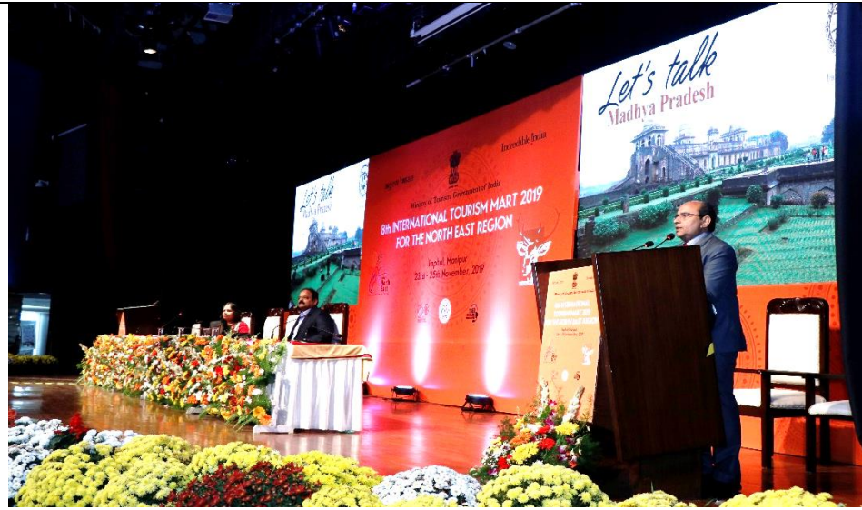
Director (Investment & Tourism) Govt. of Madhya Pradesh addressing the students/youths during ITM 2019 as it is a paired State with Manipur on 24 th November, 2019