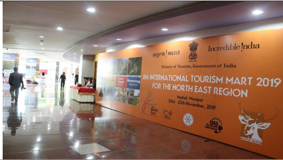
Branding of EBSB at the International Tourism Mart 2019 held at Imphal from 23 rd to 25 th of November, 2019