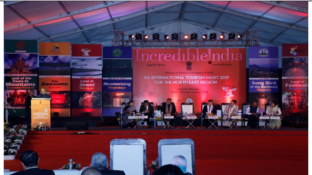
Hon'ble Chief Minister of Manipur addressing the gathering during the inaugural ceremony of International Tourism Mart 2019 at Imphal on 23-11-2019