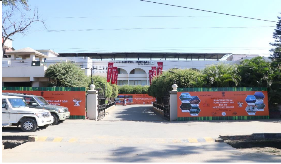
Branding at the dinner venue with EBSB logo of International Tourism Mart 2019 held on 23 rd November, 2019