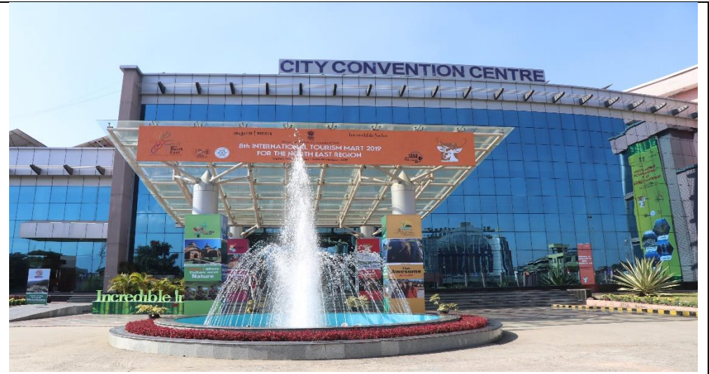
Branding of EBSB at the City Convention Centre venue of International Tourism Mart 2019 held at Imphal from 23 rd to 25 th of November, 2019