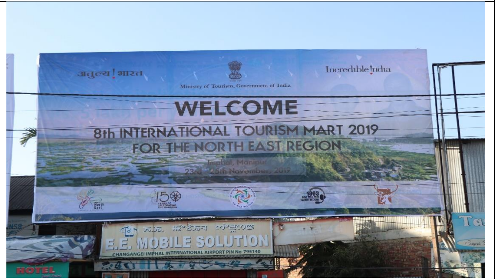
Branding in the city with EBSB logo during International Tourism Mart 2019 held at Imphal from 23 rd to 25 th of November, 2019